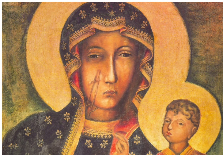
Our Lady of Czestochowa

Return to Krakow for your afternoon city tour. See the 16th century Wawel Royal Castle whose magnificent arcades have earned it the nickname "Poland's Acropolis." On to St. Mary's Church and the Old Town. Time permitting, visit the Shrine of the Divine Mercy before returning to your hotel. (B,D)